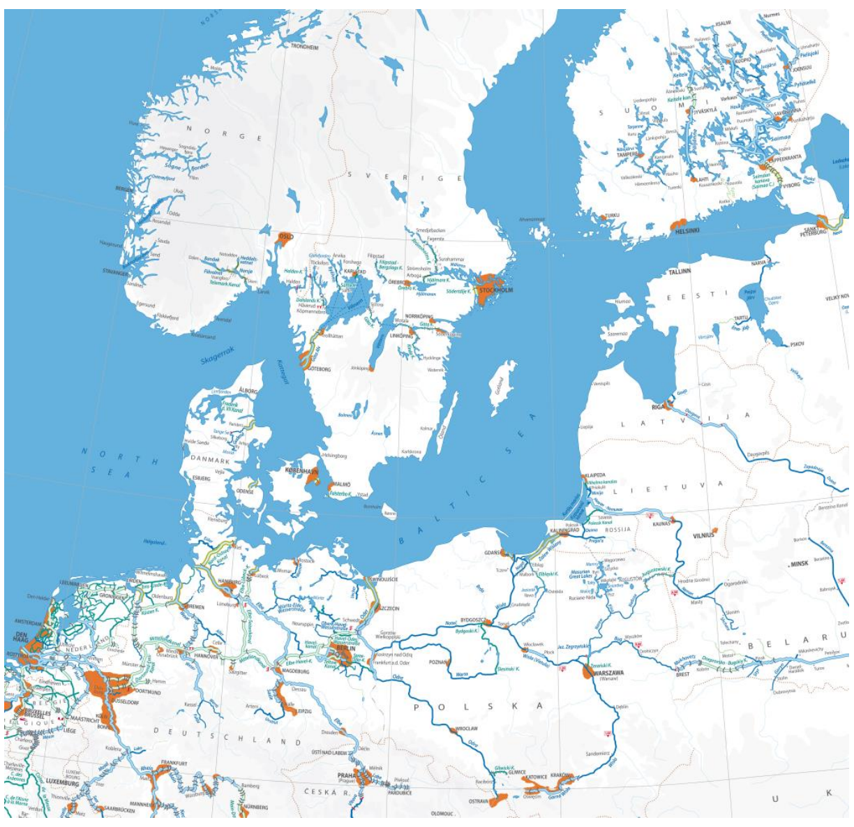
FIGURE 2 - IMPORTANT ECONOMIC AREAS CONNECTED TO INLAND WATERWAYS. REMARK FOR SWEDEN: INLAND NAVIGATION IS TIME BEING ALLOWED IN LAKE MÄLAREN AND LAKE VÄNERN INCLUDING GÖTA RIVER.

Using inland navigation and river-sea shipping is a way to shift transport of goods from road to waterways in future. The navigable inland waterway network within the EU exceeds 40 000 km<sup>5</sup> and covers all important economic areas in Central Europe. Many industrial and population centres are located along inland waterways. Half of Europe's population lives close to the coast or to inland waterways and most European industrial centres can be reached by inland navigation and river-sea shipping.